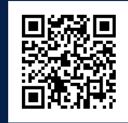
Construction Contractor Profile