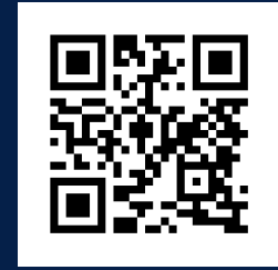
Annual Announcement Form