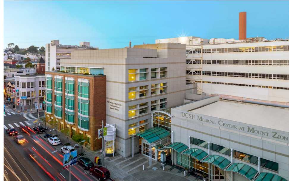
UCSF Medical Center at Mount Zion