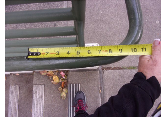
Handrails do not extend properly at landings.