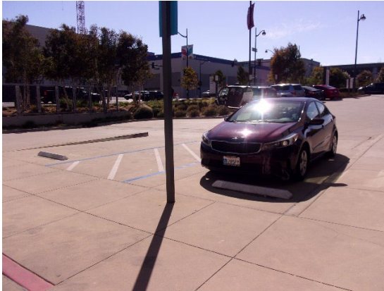
No detectable warning at hazardous vehicular way.