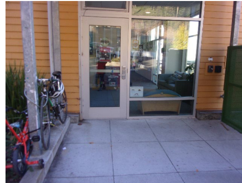
Kirkham: Not all entrances are accessible and International Symbol of Accessibility is not provided at accessible entrance.