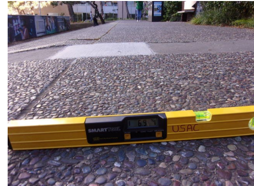
SOD: Slope of existing exterior route is greater than 1:20 (5%).