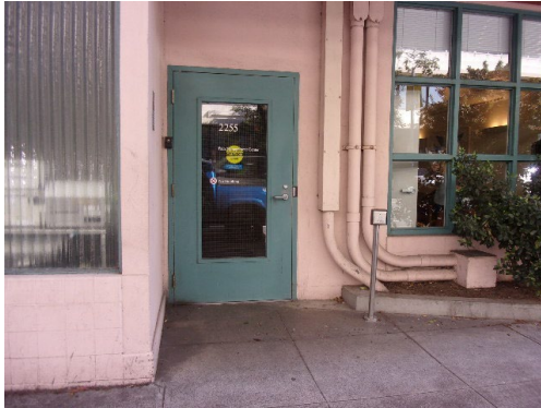
No international symbol of accessibility at accessible entrance.