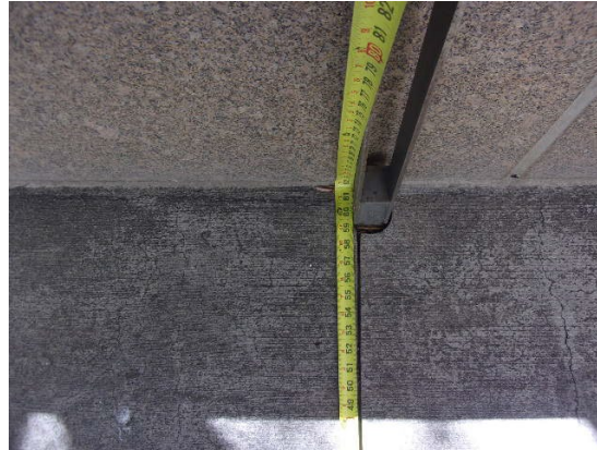
Intermediate landing with direction change is less than 72" long.