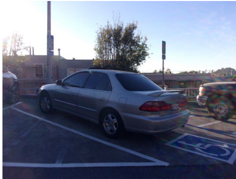
SOD: Slope of accessible parking space and/or access aisle in any direction exceeds 2.08%.