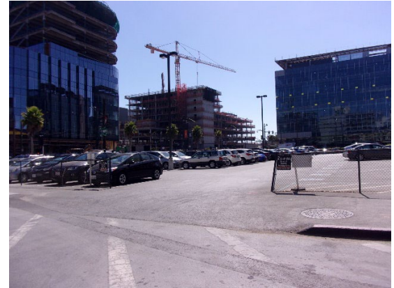
No detectable warning at hazardous vehicular way.